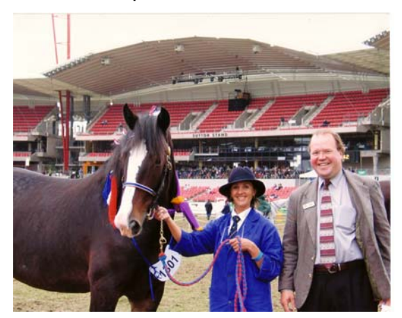
Best Shire Exhibit Sydney Royal Easter Show 2004 8

At 3pm the cold hard reality struck me that I might have to call the vet to euthanize Blossum. I realised that I had been delaying this decision for three months because I wanted to give her the best possible chance.