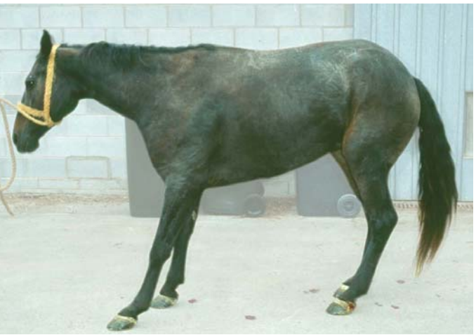
The laminitis stance

This form of laminitis may be controlled with the use of the antibiotic virginiamycin (Founderguard, Virbac Australia), which knocks out the hindgut bacteria that causes the fermentation. When given to grass fed ponies four days ahead of access to risky pasture, Founderguard prevents laminitis in situation where the risk is normally high.